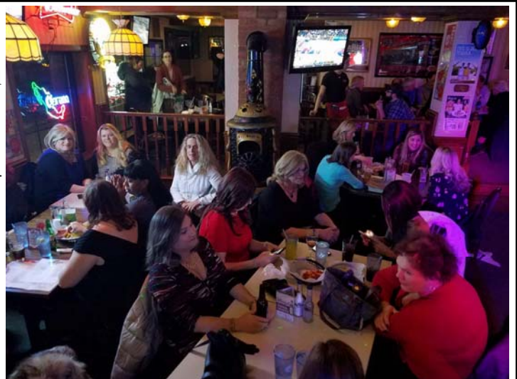
Everyone having a Blast at Tostados First Friday!

The increase in participation is not just coincidental, but rather the result of efforts by the community to come together. So keep your eyes open for more opportunities and events. And if there is an event or venue you think members may enjoy, you can share that through face book, or by sending it to the Crossport board and newsletter.