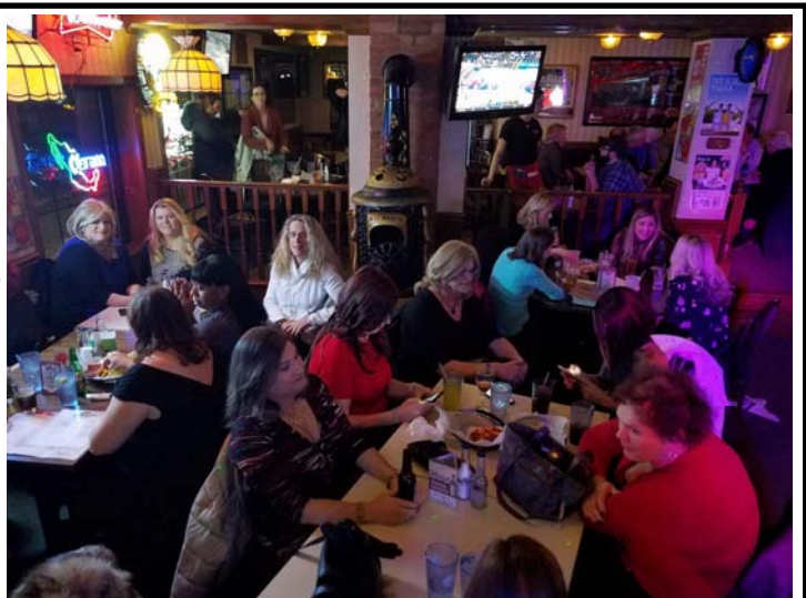
Everyone having a Blast at Tostados First Friday!

The increase in participation is not just coincidental, but rather the result of efforts by the community to come together. So keep your eyes open for more opportunities and events. And if there is an event or venue you think members may enjoy, you can share that through Facebook, or by sending it to the Crossport board and newsletter.